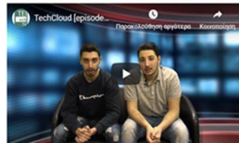
WebTV Studio facilities