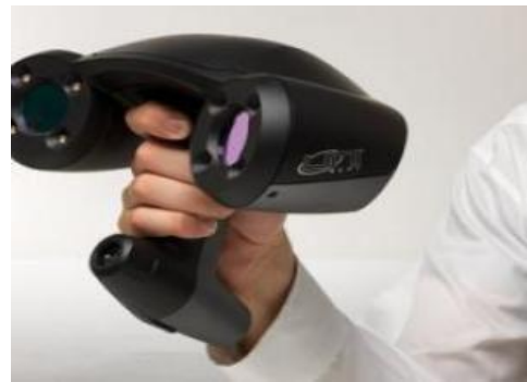
3D – Scanners