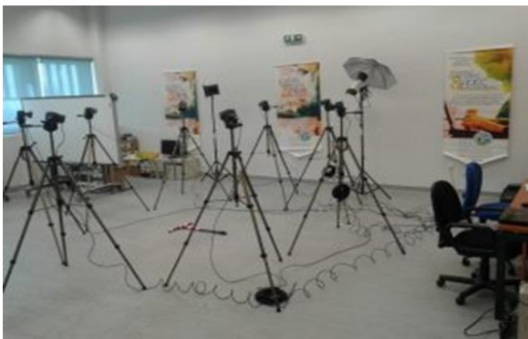
Motion Capture System -Animation creation by capturing human movement.