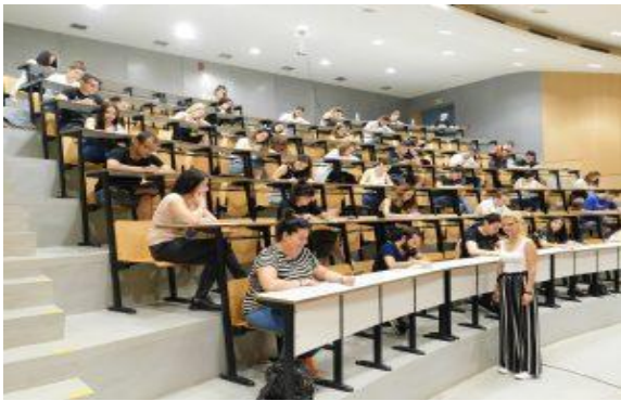
120 seat Auditorium

Strategic Communication Lab with state of art equipment such as Web TV studio, Motion Capture cameras for Animation Production, 3D Scanners, 3D Cameras & 3D TV and Monitors, software for image and video editing, 3D editing and production, as well as equipment for mixed reality viewing and production. The Department infrastructure is presented on the Department web page: https://cdm.uowm.gr/infrastructure/?lang=en .